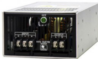
Nova Electric: Compact, Lightweight COTS Inverters Industry Smallest 120VA to 4500VA: