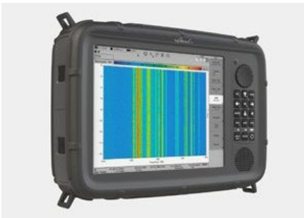
Narda Safety Test Solutions— SIGNALSHARK— Real-Time Handheld Analyzer - Signal Analyzer for Detection, Analysis, Classification and Localization of RF Signals between 9 kHz and 8 GHz. Applicable for mobile and stationary use. It supports Narda directional and full automatic direction finding antennas. .