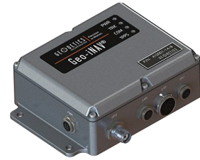
Geodetic: Geo-iNAV® Advanced GPS/INS Navigation System