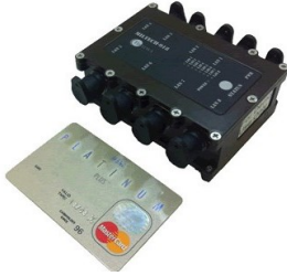
MilSource: MILTECH™ 918 Compact, Portable Military Managed Gigabit Ethernet Switch