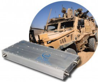
ETL: RF Power Amplifiers : RF frequency jamming systems, Medical Radar simulators, Communication testing, Electromagnetic Compatibility (EMC) testing